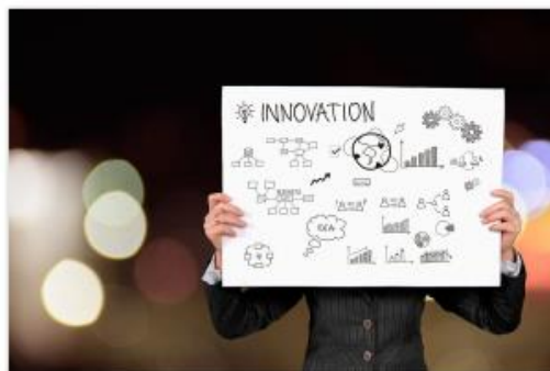
EU-China Cross-Border Innovation & Technology Transfer