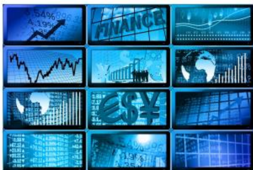
EU-China Cross-Border Investments