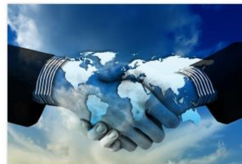
EU-China Cross-Border Communication